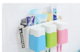
Holding Toothbrush Hanging Stand

(Acrylic Foam) with recolor PE Release Liner