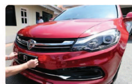
Sticking Number Plate