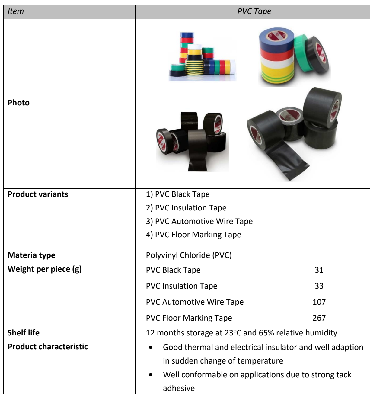
Table 1: Information on the system assessed of PVC Tape

Four PVC tapes model have been selected by GTG Manufacturing for this GHG assessment. Brief product information is provided below.